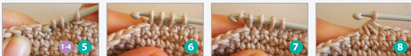
Abbreviated steps for the double decrease