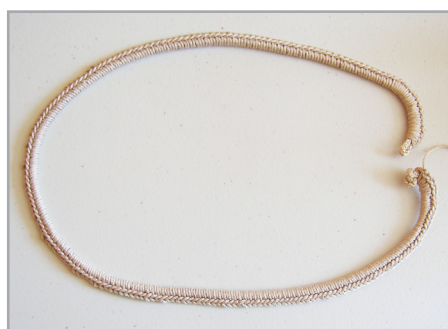
Steps to shape the necklace