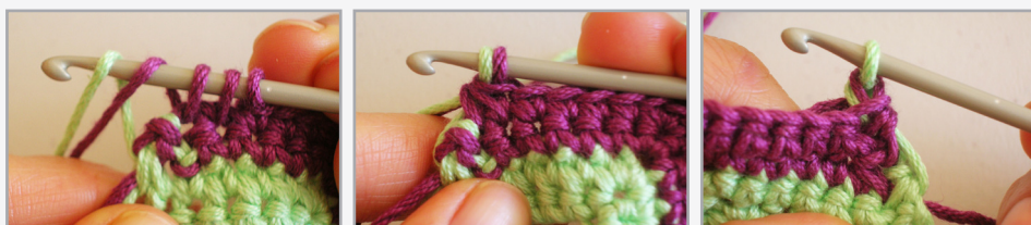
Example on how to change color from PURPLE to PISTACHIO, finishing the decrease with two colors and starting next row with PISTACHIO