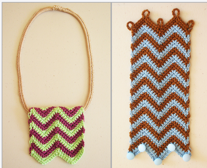
Necklace and bracelet with zigzag pattern