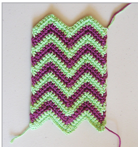
Zigzag piece finished after 22 rows

Take the macrame cord and mark 2.8"/ 7 cm on each side. On one side make the buttonhole by folding the cord. On the other make two knots, one over the other to make a button. With CAMEL sc wrapping the cord, leave the buttonhole free and wrap the beginning strand as well. Sc 195 distributing the sts all over the cord until reaching the knot. Fasten off. With regular sewing thread make a few sts on both edges.