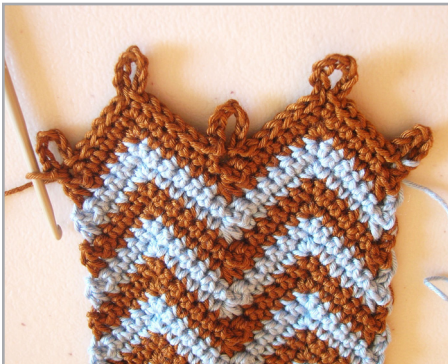
R37, steps to make the eyelets