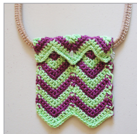
Fold the zigzag piece wrapping the cord