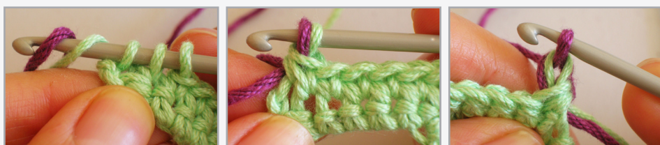
Example on how to change color from PISTACHIO to PURPLE, finishing the decrease with two colors and starting next row with PURPLE